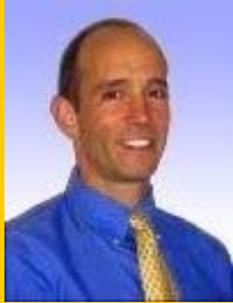
Dr. Joseph Mercola Author of the Total Health Program