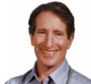
Ron Rosedale, MD

In fact, we, ourselves, are not really doing the eating. It is our cells that eat. When we put food in our mouth, that is just a continuation of the transport of food from the farms to the grocery store then into our mouth; the food is then transported to our cells by our bloodstream. It is our cells that really do the eating and that need the fuel and the parts to regenerate themselves.